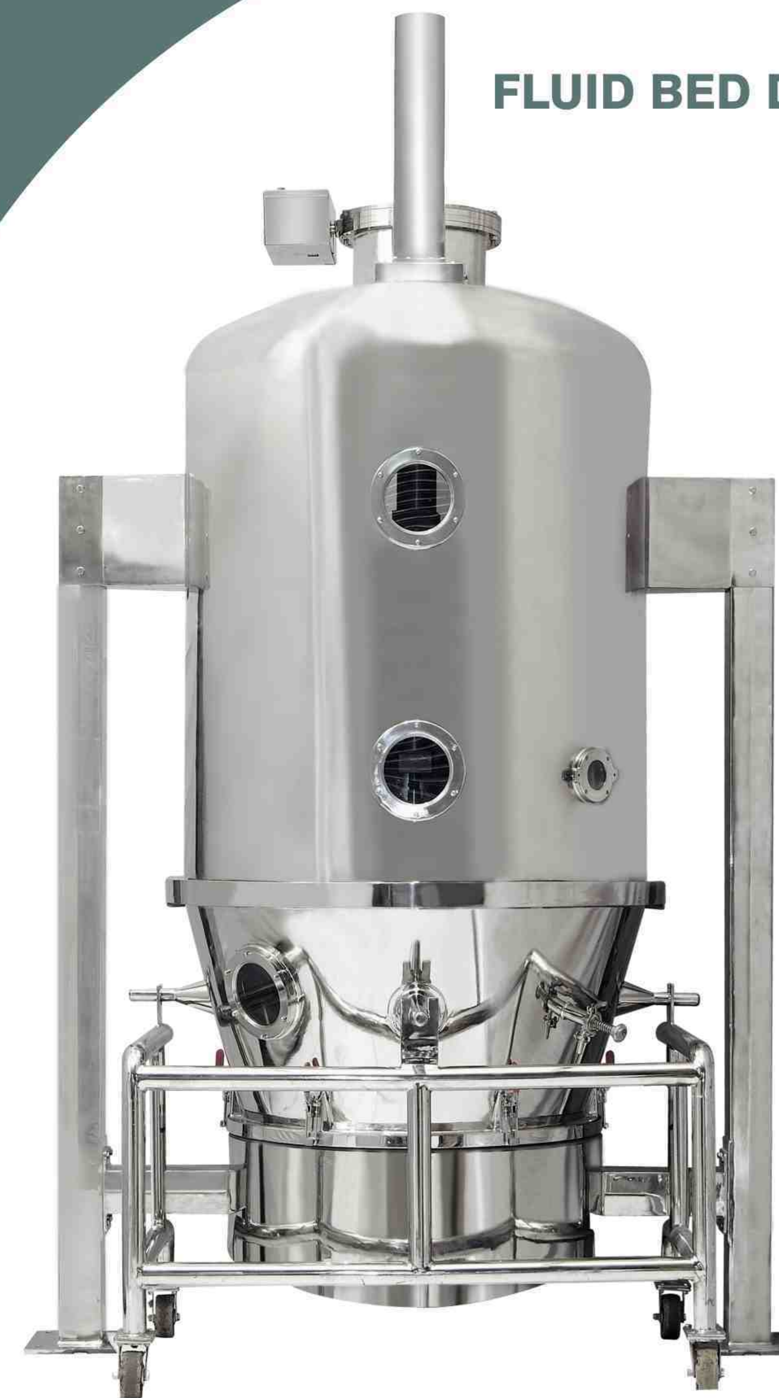
FLUID BED DRYER