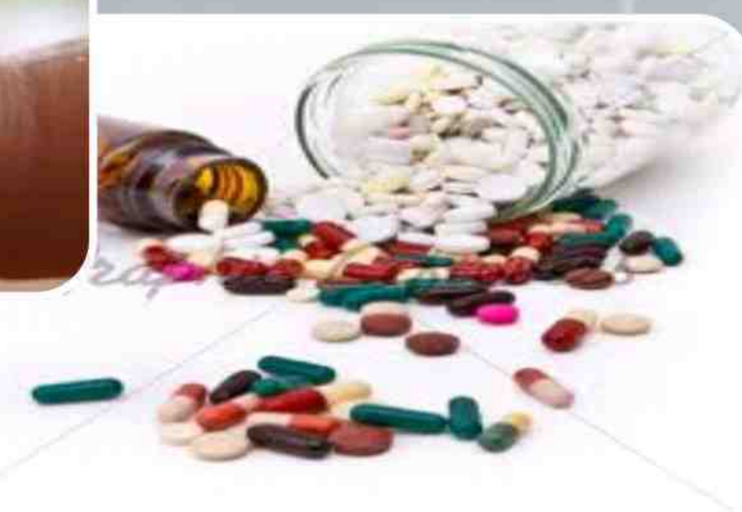
Tablet Granulation Section