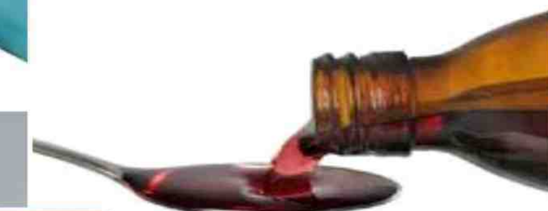
Liquid Oral Section